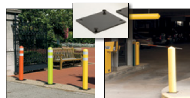
Poly Guide-Post Delineators

Create a low-cost, maintenance-free caution zone. These 42 in. (159 cm.) – high poly bollards are available in a 5 in. (18.9 cm.) or 7 in. (26.5 cm.) model with a poly base with anchor slots (3/4 in./2.8 cm.) that can be anchored for maximum stability or used with optional weighted steel base.