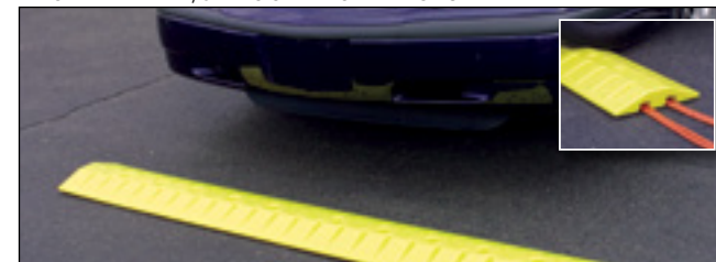
Model 1792 6 ft. Speed Bump - Cable Guard/in: 10W x 2H x 72L cm: 25.4W x 5.1H x 182.9L