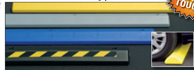
Model 1790Y Parking Stop - Yellow in: 8W x 4H x 72L/cm: 20.3W x 10.2H x 182.9L