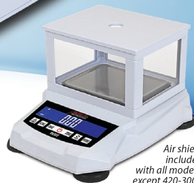
Air shield included with all models, except 420-3000