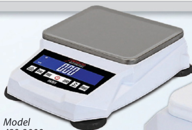
Model 420-3000 with larger size platform