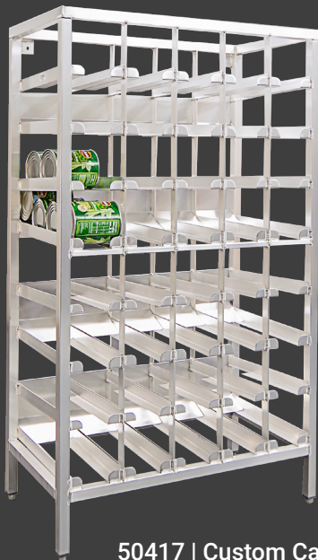
50417 | Custom Can Rack

This First-In, First-Out Can Rack was designed for a local school. It holds 140, #10 cans and is only 24" deep.