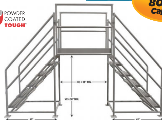
Example Shown: Model CS527-CB627 (27" Overall Width)