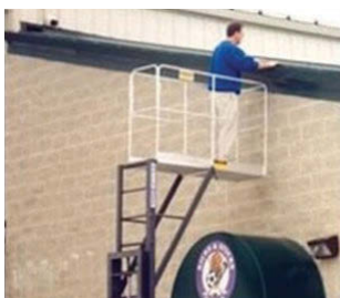
Cantilevered platform extends 34" beyond base frame