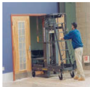
Rolls thru standard doorway