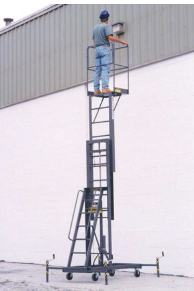
Ballylift Model # BL-315