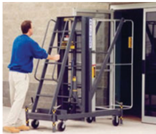
Rolls thru standard doorway