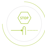
ON-OFF SAFETY SENSORS

It also has overload protection and an emergency stop button that deactivates all the systems if needed.