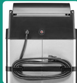
CORD WRAP FOR EASY STORAGE ON BACK OF UNIT