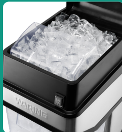
HIGH-CAPACITY 5-LB. ICE CUBE HOPPER