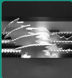
COMMERCIAL-GRADE STAINLESS STEEL BLADES