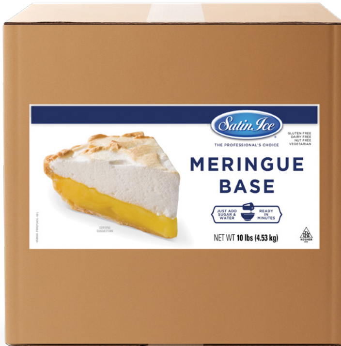
MERINGUE BASE 10 lb (4.53 kg) Box