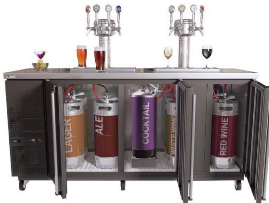
Beverage Tank™ installed in a MBB78BC-E-B. For more Beverage Station™ info see page 152.