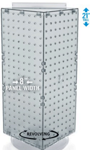
#703385 8"W 8"D x 20"H Pegboard Panel Size *NOT available in purple or almond panel color

UNIT MEASUREMENTS: #703385 measures 8"W x 8"D x 20"H and revolves on a plastic 9" dia. base. Assembled: 21"H. Ships ASSEMBLED in 1 Box: 7 LBS. 24"L x 11"W x 11"H. #701414 measures 14"W x 14"D x 20"H and revolves on a plastic 15" dia. base. Ships FLAT in 1 Box 1: 10 LBS. 25"L x 15"W x 4"H dia. base. Assembled: 21"H.