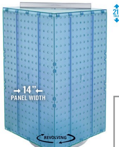
#701414 14"W x 14"D x 20"H Pegboard Panel Size *NOT available in purple panel color