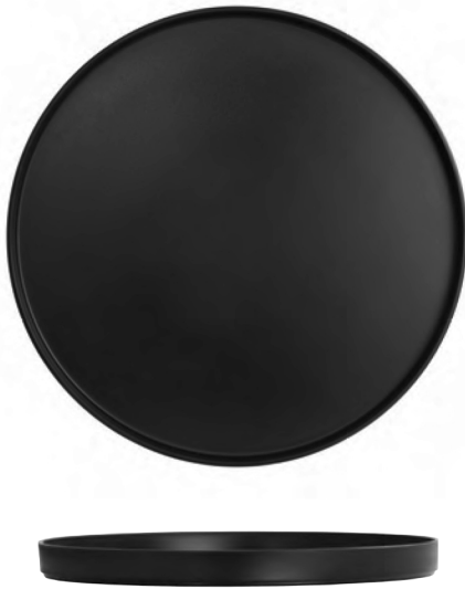
16" LOW RIM PLATTER

Specify Color: Black (-13), White (-15).