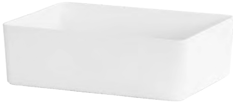
16X12 RAISED RIM RECTANGULAR PLATTER NEW