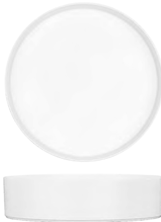
RAISED RIM ROUND BOWLS

Specify Color: Black (-13), White (-15), Stone Blue (-111).