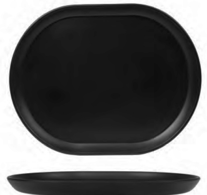
14" OVAL PLATTER

ITEM 22550-14 | 14DIAx3½H | 160oz | N/A Stone Blue