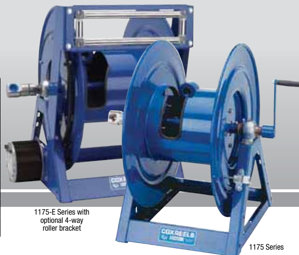
1175-E Series with optional 4-way roller bracket