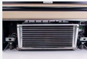
Oversized condenser coil