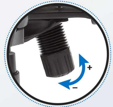
Tilt tension knob