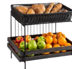
Compatible with standard GN size trays and baskets.