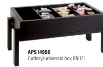
APS 14956 Cutlery/universal box GN 1/1