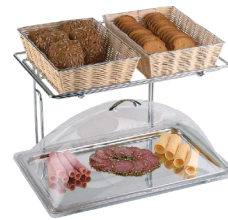
APS 11555 GN 1/1

Works great with serving pieces sized larger than the base.