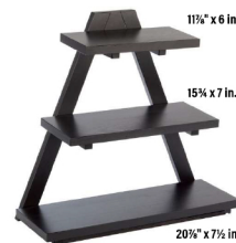
11 1/2" x 6 in.