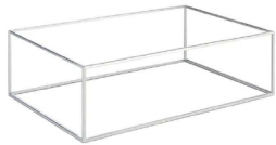
APS 15501 GN 1/1; 2/4