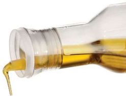
Spout allows drip-free pouring.