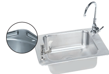
Faucet & Bubbler Optional