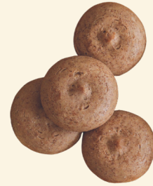
Dollops: 1/2oz & 1oz