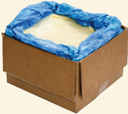
Bag in box: 30lb