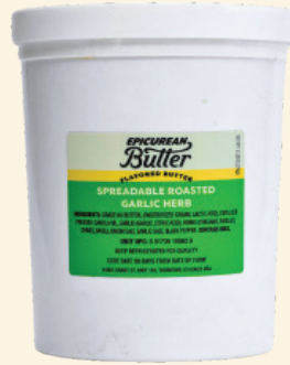
Tubs: 1lb & 5lb