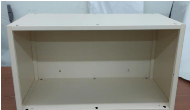
Remove the wire organizer and contents from the Cubbie File Storage Cabinet