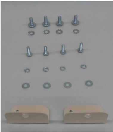
Enclosed hardware and (2) stop plates