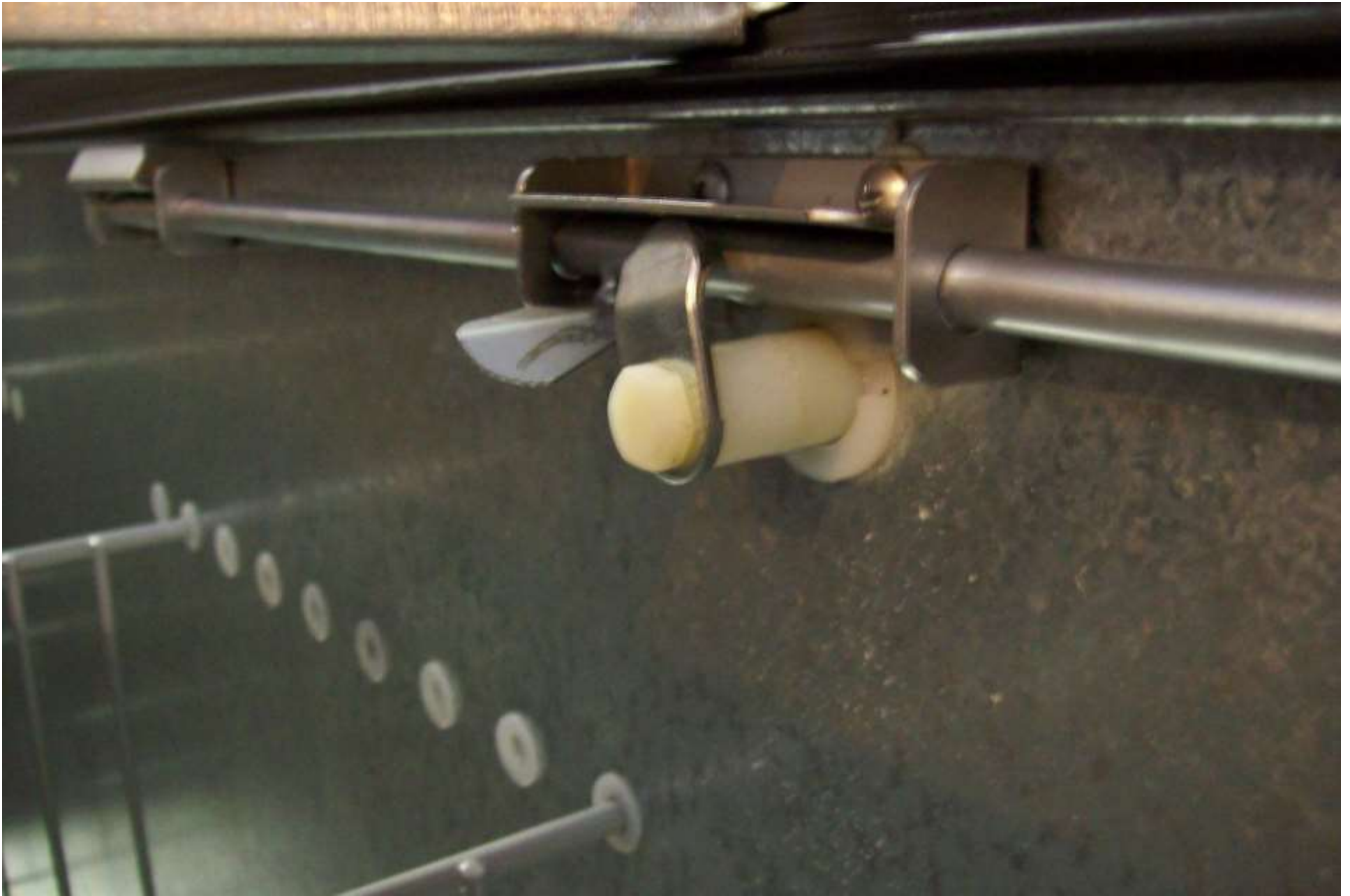
INSTALLED – LOCKED POSITION