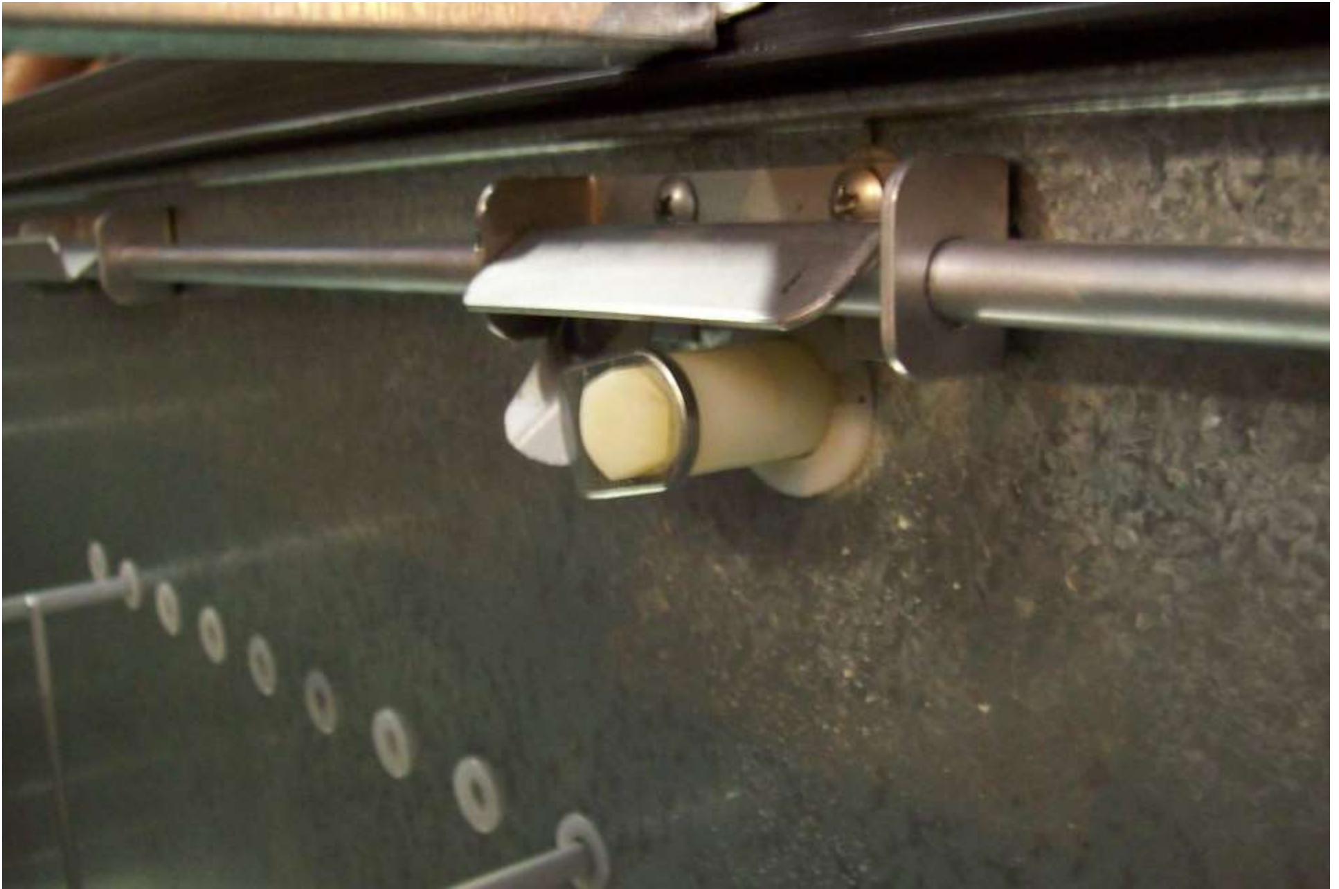
INSTALLED – UNLOCKED POSITION