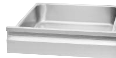
Budget Drawer: FS & FG Series

CHECK FOR CONCEALED DAMAGE FILE CLAIM WITH DELIVERING FREIGHT CARRIER