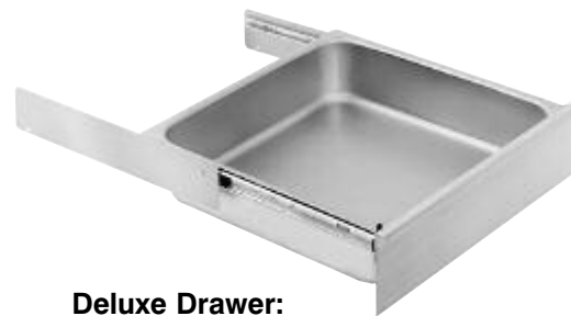
Deluxe Drawer: SS & GZ Series