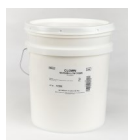
Bulk Marshmallow Crème Topping #98010 - 5 gal. Pail