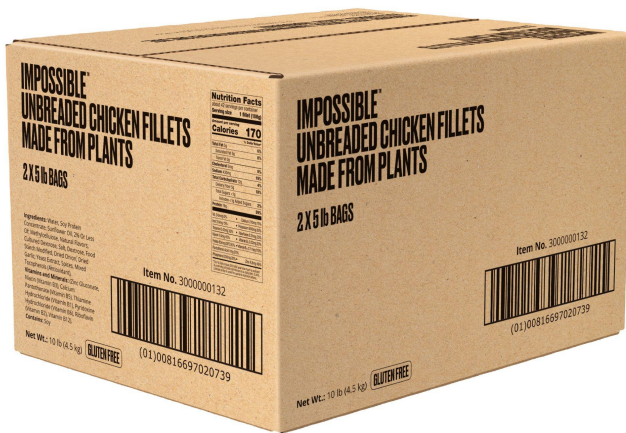
Figure A. Case