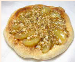
Apple Brown Betty