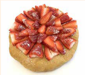
Top with Fruit