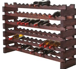
6 layers of 12 bottles each (72 total) Order: 3 ea. #20-4536DSET (Stained) 2'9" H x 47-1/2" W x 11-5/8" D