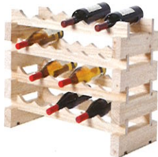
4 layers of 6 bottles each (24 total) Order: 2 ea. #20-4530SET (Natural) 1'10" H x 26" W x 11-5/8" D