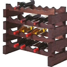
4 layers of 6 bottles each (24 total) Order: 2 ea. #20-4530DSET (Stained) 1'10" H x 26" W x 11-5/8" D