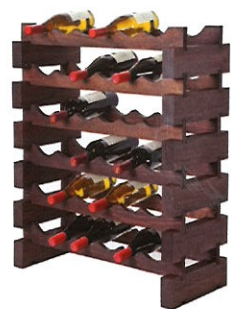
6 layers of 6 bottles each (36 total) Order: 3 ea. #20-4530DSET (Stained) 2'9" H x 26" W x 11-5/8" D