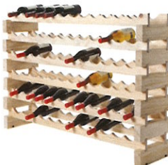
6 layers of 12 bottles each (72 total) Order: 3 ea. #20-4536SET (Natural) 2'9" H x 47-1/2" W x 11-5/8" D