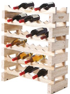
6 layers of 6 bottles each (36 total) Order: 3 ea. #20-4530SET (Natural) 2'9" H x 26" W x 11-5/8" D