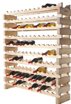
10 layers of 12 bottles each (120 total) Order: 5 ea. #20-4536SET (Natural) 4'7" H x 47-1/2" W x 11-5/8" D