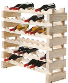
6 layers of 8 bottles each (48 total) Order: 3 ea. #20-4532SET (Natural) 2'9" H x 33" W x 11-5/8" D