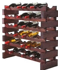
6 layers of 8 bottles each (48 total) Order: 3 ea. #20-4532DSET (Stained) 2'9" H x 33" W x 11-5/8" D