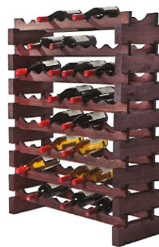
8 layers of 8 bottles each (64 total) Order: 4 ea. #20-4532DSET (Stained) 3'8" H x 33" W x 11-5/8" D