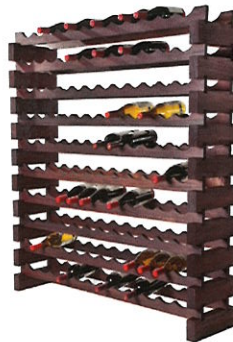
10 layers of 12 bottles each (120 total) Order: 5 ea. #20-4536DSET (Stained) 4'7" H x 47-1/2" W x 11-5/8" D