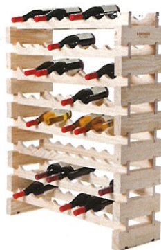
8 layers of 8 bottles each (64 total) Order: 4 ea. #20-4532SET (Natural) 3'8" H x 33" W x 11-5/8" D