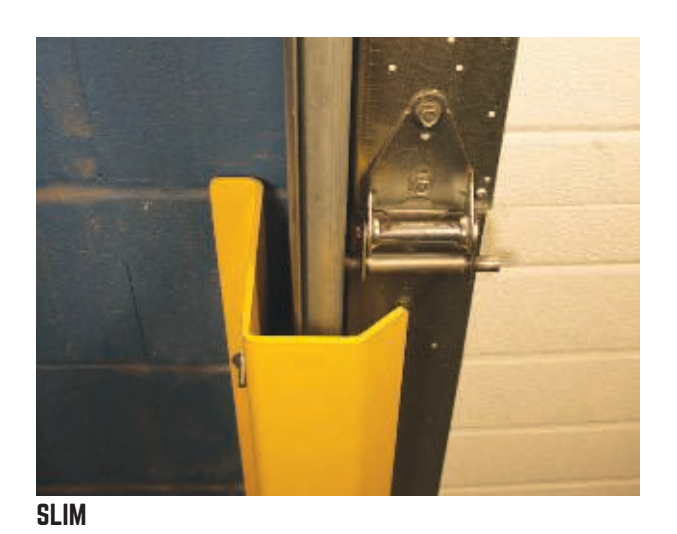
MORE SAFETY SOLUTIONS