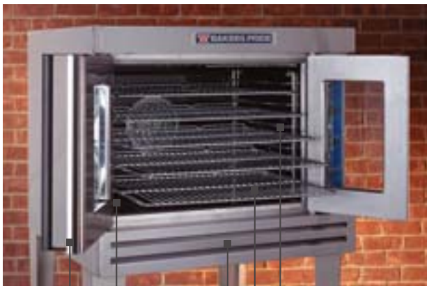
Porcelain Enamel Interiors 2" Thick Industrial-Grade Insulation 11-Position Rack Guides Nickel-Plated Wire Racks with Positive Stops Stainless Steel Fronts, Sides and Tops

Large double pane thermo-windows are standard for viewing without opening the oven doors.