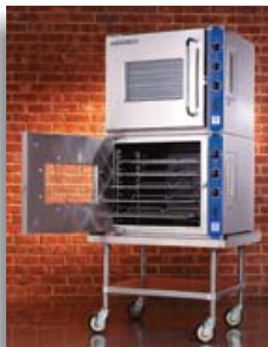
Model COC-E Half-Size Ovens Shown Stacked on Optional Stainless Steel Utility Stand