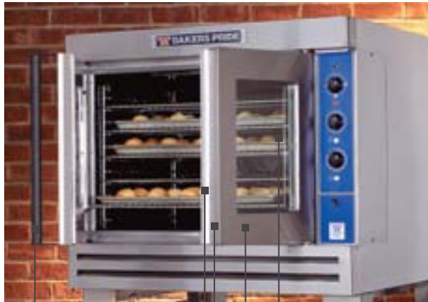
Stainless Steel Gaskets Full-Height "Cool Touch" Handle Double Pane Thermo-Windows All Stainless Steel Construction Heavy-Duty Industrial Grade Insulation