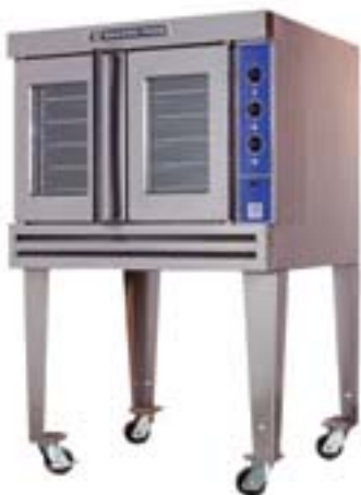
CO11-G1 with optional casters