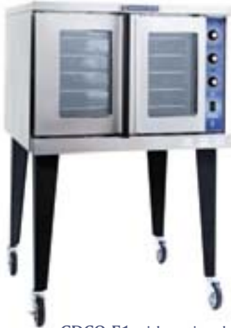
GDCO-E1 with optional casters