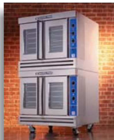
Model CO11-G Full-Size Ovens Shown Stacked on Optional Casters