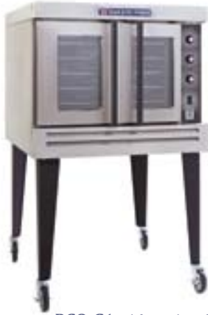
BCO-G1 with optional casters