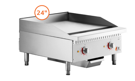
24" Electric Griddle, Thermostatic Controls Two independently controlled burners 208/240V, 6,000W / 8,000W

12" Electric Griddle, Thermostatic Controls One burner 208/240V, 3,000W / 4,000W