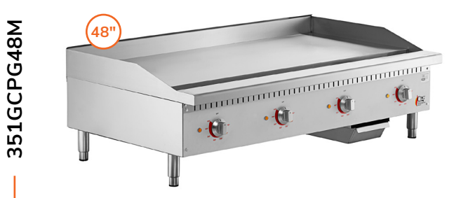
48" Electric Griddle, Thermostatic Controls Four independently controlled burners208/240V, 208/240V, 12,000W / 16,000W