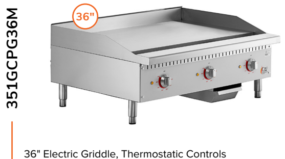
36" Electric Griddle, Thermostatic Control: Three independently controlled burners 208/240V, 9,000W / 12,000W