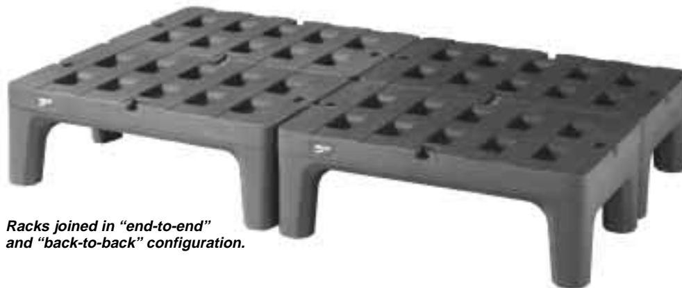
Racks joined in "end-to-end" and "back-to-back" configuration.