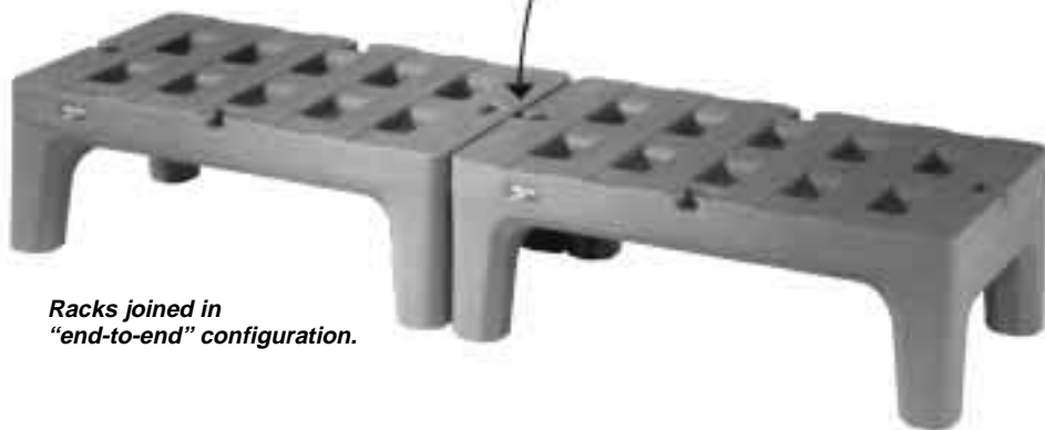
Racks joined in “end-to-end” configuration.