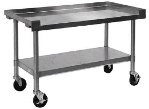
Model Heavy Duty Cookline Stand