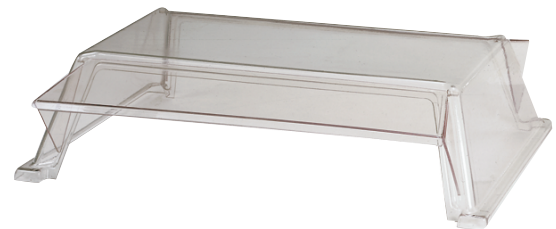
Model 45SG-FCA with optional SGS Sneeze Guard Shields