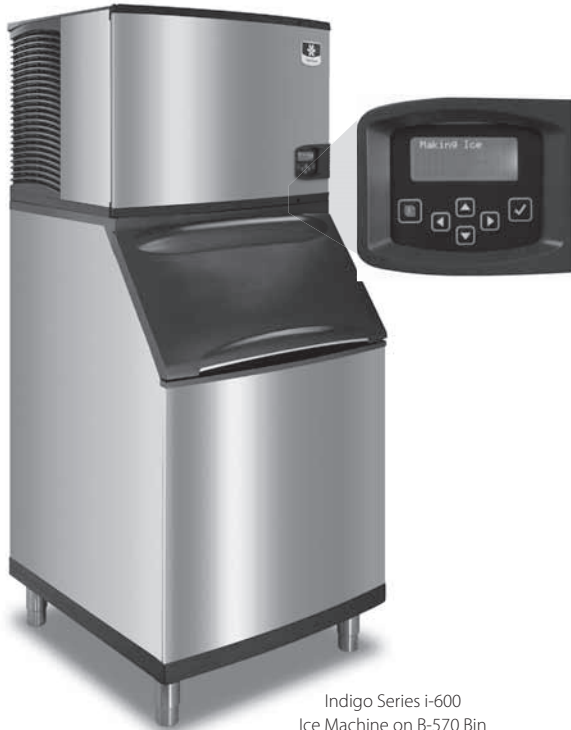
Indigo Series i-600 Ice Machine on B-570 Bin

Model: ID-0602A IY-0604A ID-0603W IY-0605W ID-0692N IY-0694N