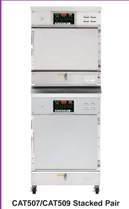
CAT507/CAT509 Stacked Pair