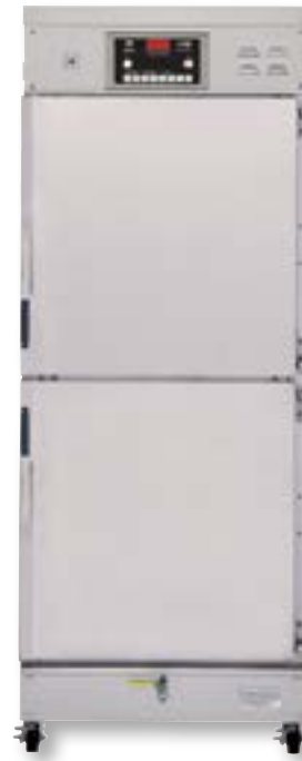
CAC522 CVAP® COOK & HOLD OVEN FULL SIZE MODEL WITH FAN 8000 Series Electronic Controls

CVap equipment complies with domestic and international requirements such as UL, C-UL, UL Sanitation, CE, MEA, and others.