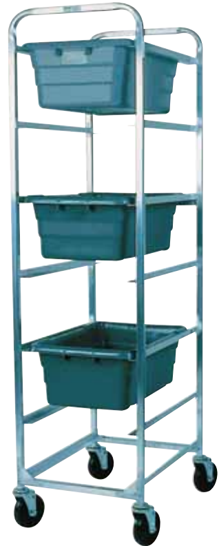
AL-L-6 Equipped with gusset legs for extra strength.