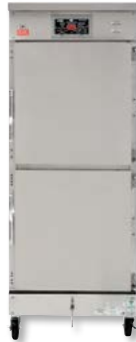
HL4522 CVAP® HOLDING CABINET FULL SIZE MODEL, WITH FAN Electronic Differential Control

CVap equipment complies with domestic and international requirements such as UL, C-UL, UL Sanitation, CE, MEA, and others.