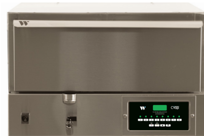
HBL5W1 CVAP® HOLD & SERVE DRAWER WITH FAN

CVap equipment complies with domestic and international requirements such as UL, C-UL, UL Sanitation, CE, MEA, and others.