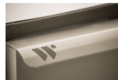
New Handle Design comfortable grip with a sleek modern look.