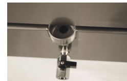
Easy Fill Spout makes filling and draining the unit a snap!

CVap® Hold & Serve Drawers are designed for high quality holding and serving of a wide variety of menu items for extended times. They are ideal for holding, warming, and serving.