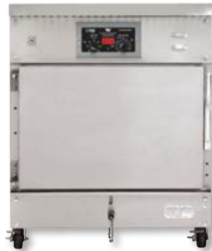
HA4507 CVAP® HOLDING CABINET HALF SIZE UNDER COUNTER MODEL WITH FAN Electronic Differential Control

CVap equipment complies with domestic and international requirements such as UL, C-UL, UL Sanitation, CE, MEA, and others.