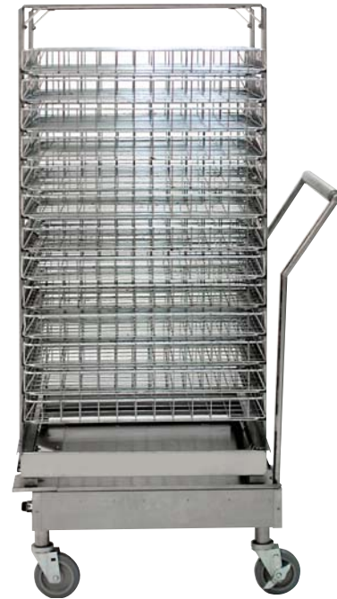
WIDE BASKET DOLLY FOR USE WITH CVAP® CAT529-BD/BDR

One-year limited warranty covering materials and labor.