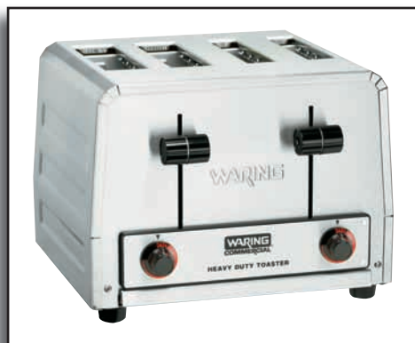
WCT810/WCT815/WCT815B Combination Toasters