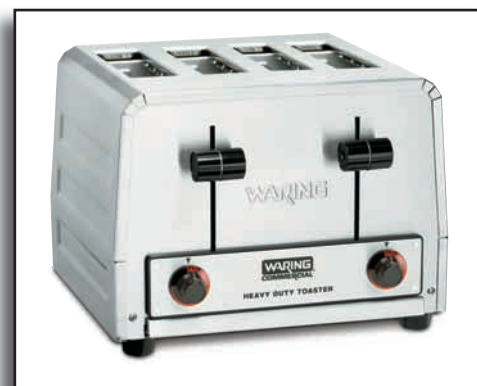
WCT820 Bagel Toaster