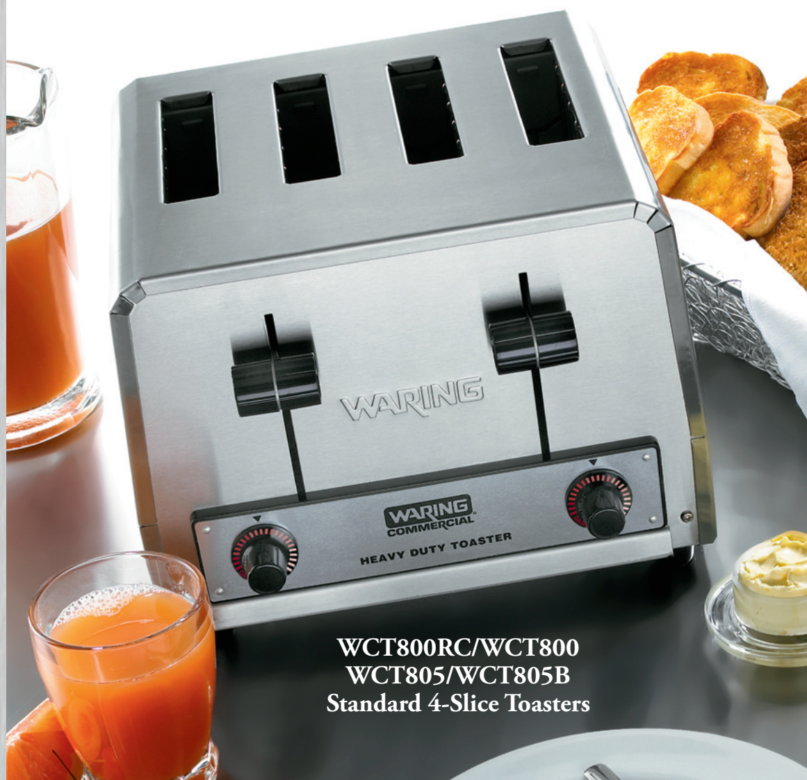
WCT800RC/WCT800 WCT805/WCT805B Standard 4-Slice Toasters