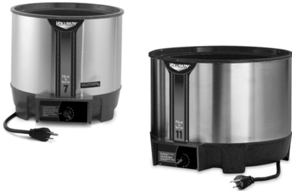
7-Quart and 11-Quart Heat 'N Serve Food Merchandisers