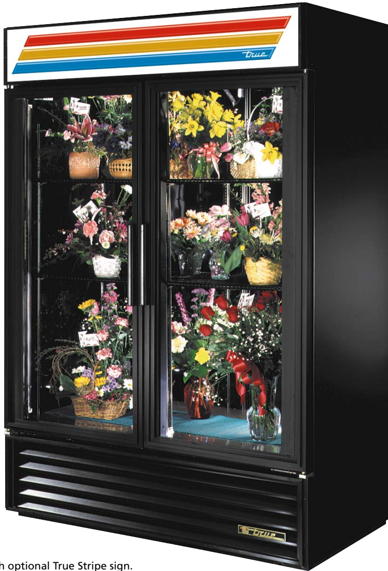
Shown with optional True Stripe sign.