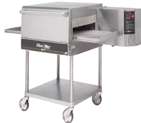
UM1854 (Single) with Optional Stand