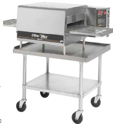
UM-1850A with Optional Stand