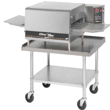
UM-1833A with Optional Stand

Star's Holman Ultra-Max electric conveyor ovens are covered by Star's one year parts and labor warranty.