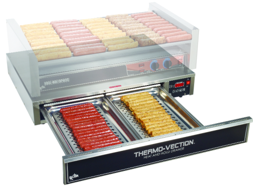
Model TVD50 shown with roller grill (sold separately)