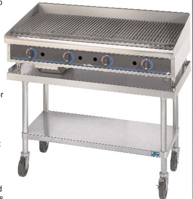
Model 6148RCBD with Optional Equipment Stand