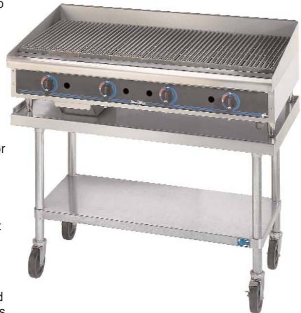
Model 6148RCBD with Optional Equipment Stand