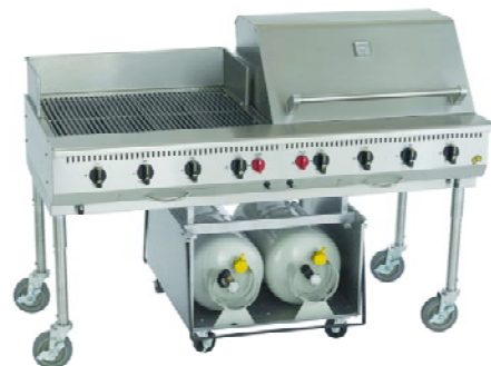
Model OCB60TH with Optional Wind Guard