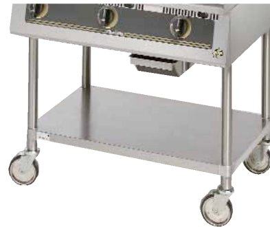
Models ES-UM36SFC Pre-Cut Floor Models with optional casters

Equipment stands are covered by Star's one year parts and labor warranty.