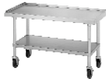
Models ES-UM36S with optional casters