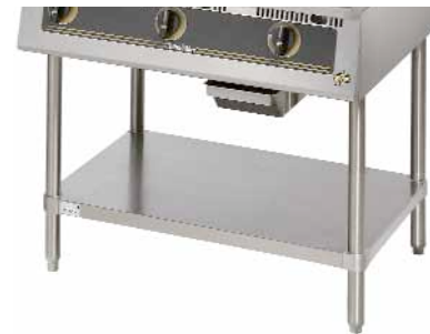
Models ES-UM36SF Floor Model