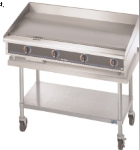
Model 548TGD with Optional Equipment Stand

Star-Max™ electric griddles are covered by Star's one year parts and labor warranty.