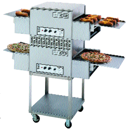
Model 314HX Stacked

Proveyor ovens are covered by Holman's one year parts and labor warranty.